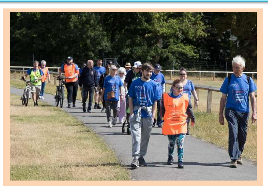
Walkers on the annual Bushy Park Walk

The Care and Support Groups continue to work well. Further information, including meeting dates, is on Page 10.